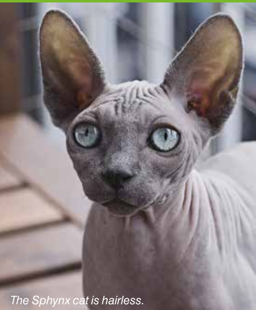
The Sphynx cat is hairless.

However, aside from hypoallergenic pets, you can also prevent or reduce the severity of allergic reactions by keeping pets out of bedrooms and spaces you regularly frequent, washing their bedding often, and washing your hands after petting them.